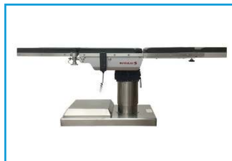
▫ Upper Body Imaging