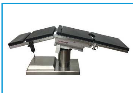
▫ Flex / Reflex Positioning