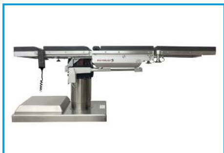
▫ Lower Body Imaging