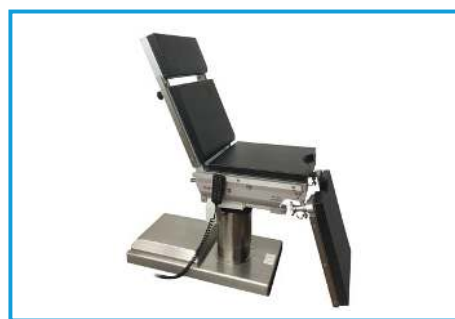
▫ Back Up Positioning