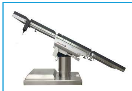
▫ Reverse Trendelenburg