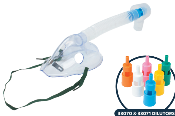
33070 & 33071 DILUTORS